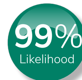
FY2024 Survey Monkey 4's & 5's

My Care Team Included Me in Decisions Regarding Care, Treatment and Goal Setting