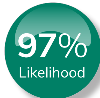
FY2024 HCAHPS (LTRAX) Top Boxes

Gaylord Patients are Likely to Recommend our Program