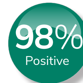
FY2024 Survey Monkey 4's & 5's

Accuracy Rating of Information Received Prior to Admission