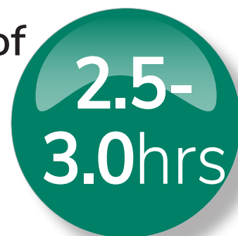
FY2024 Gaylord Patient Discharge Report