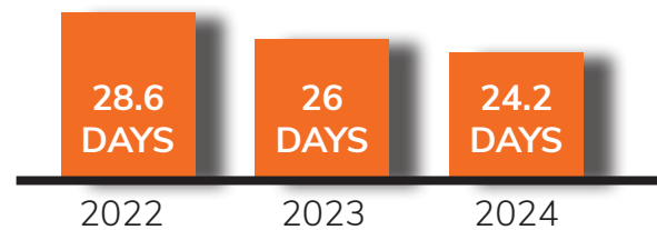
FY2022-FY2024 Gaylord Discharge Data