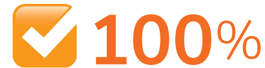
FY2024 Internal Patient Survey Data Top Boxes