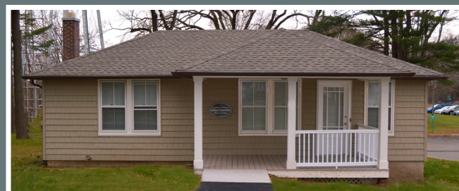
The Maximilian E. and Marion O. Hoffman Foundation Guest Cottage