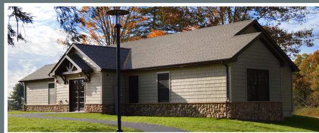
MoraLee Guest Cottages